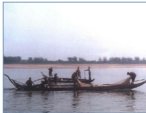
Mekong riverscapes + fishtraps