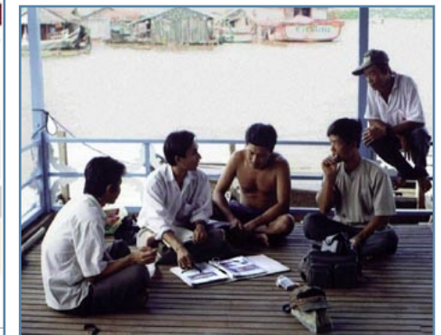
Interviews with working fishers